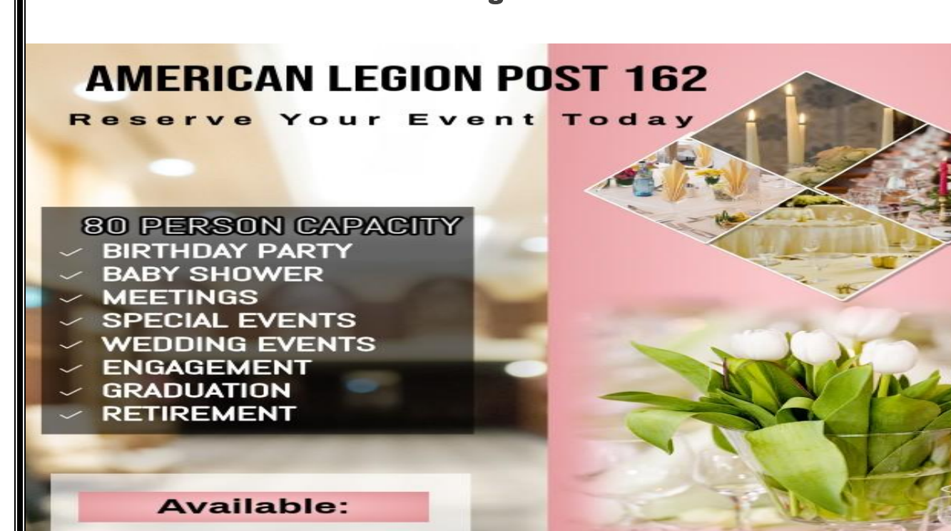
Table and Chairs