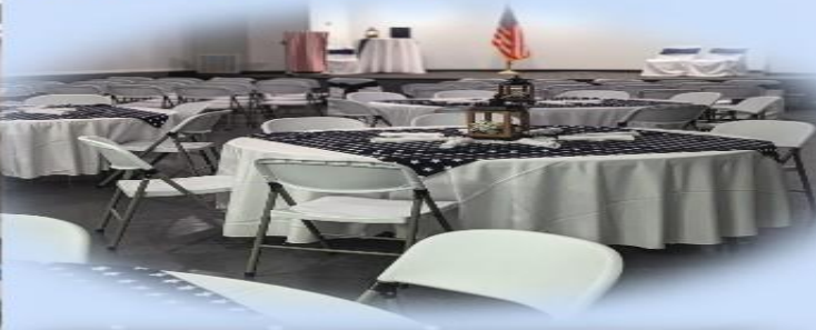
Table and Chairs Large Fenced Backyard Playground Fire Pit Picnic Tables Horse Shoe Pits